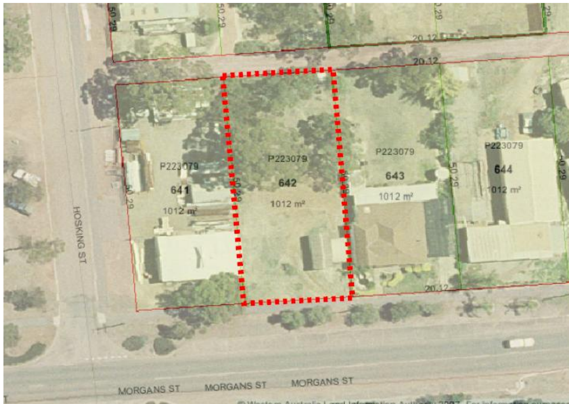
Subject Site edged in red (LandGate 2007)