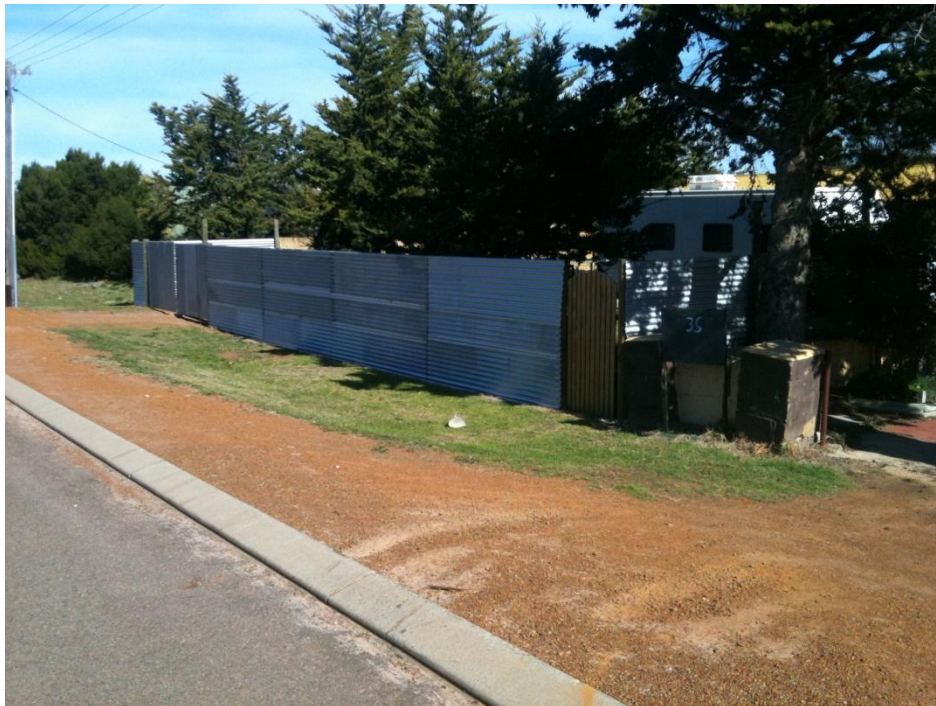
Subject Site and front fence

Gibson Way is predominantly an open streetscape with little or no front fencing. The exception is the corner lot that had shade cloth above a 900mm high fence.