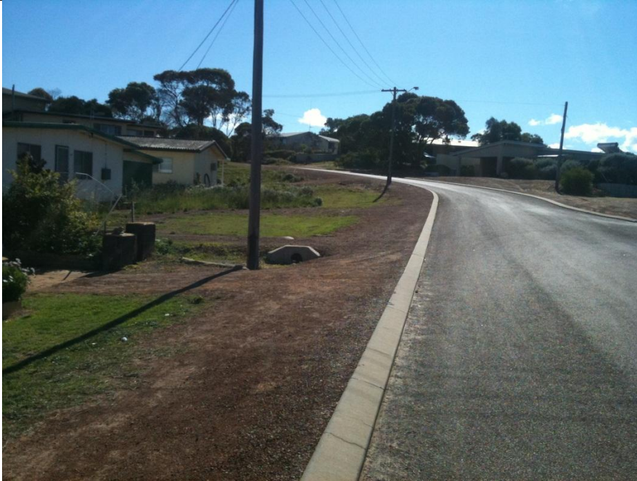
Looking west from the subject site - Gibson Way – predominantly open streetscape.