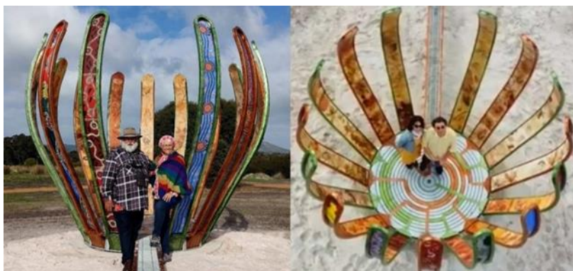
Photographs (above) showing the physical Genestreams sculpture at Twin Creeks, north of Porongurup.